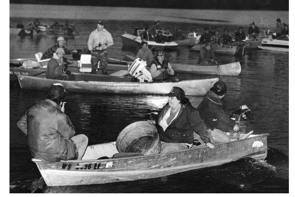
Prejudiced response. Efforts by the Chippewa to exercise their treaty rights to spearfishing in northern Wisconsin met with racially charged protests from whites.

dispute. The data also allow them to develop measures of the key constructs from each of the three contending racial attitudes models. Their results compellingly demonstrate the failure of the nonracial values approach to explain white opinion. The authors present a series of statistical analyses that demonstrate the impact of racial predispositions on opinion, above and beyond individual demographic characteristics. They also make excellent and extensive use of respondents' own words, from open-ended responses, to show the ways that white Wisconsin residents' reactions to the Chippewa and to treaty rights are deeply and subtly inflected with racial considerations. These findings underline the conclusion that matters of race are still very much a part of white Americans' political cognition.